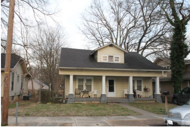
1225 Joseph Avenue Nashville, TN 37207

Property Features: Single Family Dwelling Year Built: 1940 Bedroom: 5 Bathroom: 1 Square Footage: 1,152 Acreage: 0.16