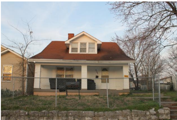
1510 14th Avenue North Nashville, TN 37208

Property Features: Single Family Dwelling Year Built: 1929 Bedroom: 4 Bathroom: 1 Square Footage: 1,522 Acreage: 0.19