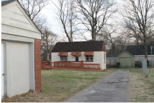
2706 B Brunswick Drive Nashville, TN 37207

Property Features: Single Family Dwelling Year Built: 1950 Bedroom: 2 Bathroom: 1 Square Footage: 696 Shared Acreage: 0.37