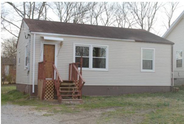
110 McKinley Street Madison, TN 37115

Property Features: Single Family Dwelling Year Built: 1955 Bedroom: 2 Bathroom: 1 Square Footage: 720 Acreage: 0.12