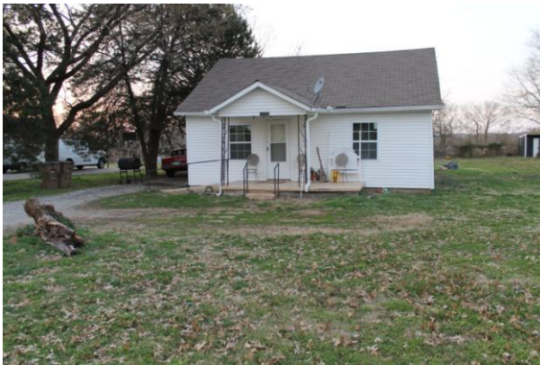
1609 Elizabeth Road Nashville, TN 37218

Property Features: Single Family Dwelling Year Built: 1930 Bedroom: 2 Bathroom: 1 Square Footage: 1,351 Acreage: 0.37