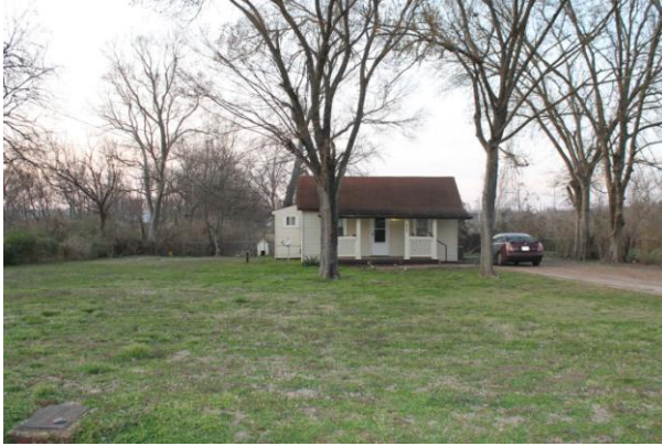
1613 Elizabeth Road Nashville, TN 37218

Property Features: Single Family Dwelling Year Built: 1930 Bedroom: 3 Bathroom: 1 Square Footage: 1,260 Acreage: 0.37