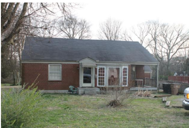
2706 A Brunswick Drive Nashville, TN 37207

Property Features: Single Family Dwelling Year Built: 1950 Bedroom: 2 Bathroom: 1 Square Footage: 2,206 Shared Acreage: 0.34